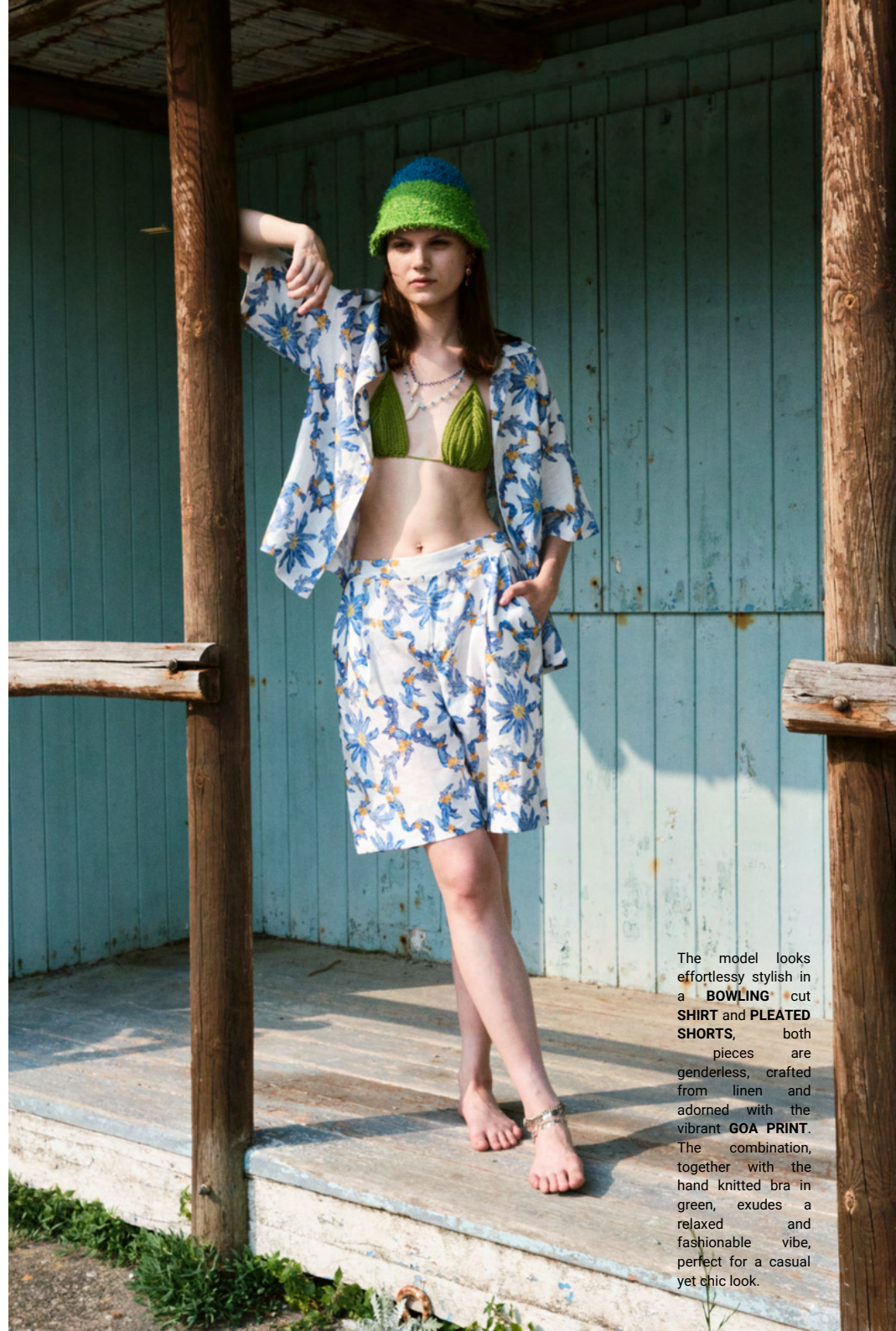
The model looks effortlessly stylish in a BOWLING cut SHIRT and PLEATED SHORTS , both pieces are genderless, crafted from linen and adorned with the vibrant GOA PRINT . The combination, together with the hand knitted bra in green, exudes a relaxed and fashionable vibe, perfect for a casual yet chic look.