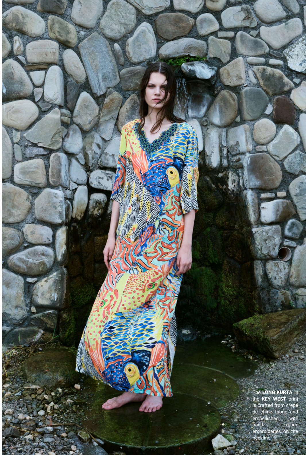
The LONG KURTA in the KEY WEST print is crafted from crepe de chine fabric and embellished with hand-made embroideries on the neckline.