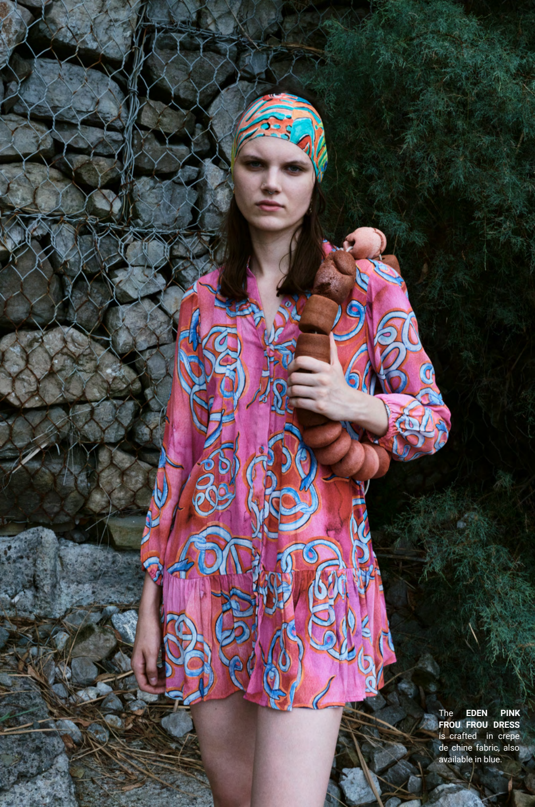
The EDEN PINK FROU FROU DRESS is crafted in crepe de chine fabric, also available in blue.