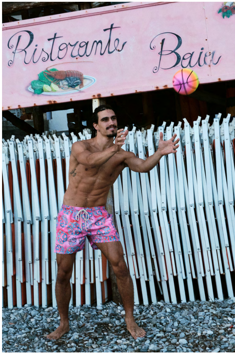
MEN'S SWIM SHORTS in EDEN PRINT in pink, up. CERAMICA PRINT, right.