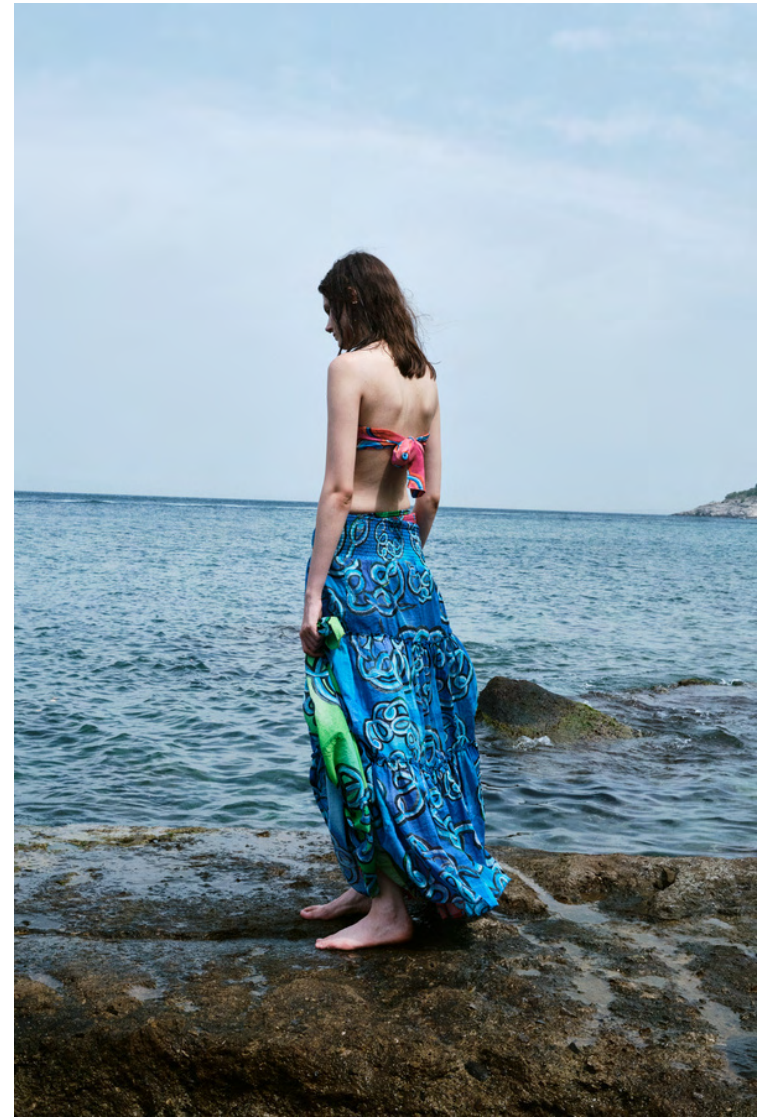
On the left page, you can find the EDEN PRINT MEN'S SHIRT in GREEN stylishly layered on top of other shirts featuring the same print but in different colors. On the top section, RUFFLED SKIRTS in EDEN PRINT made in cotton.