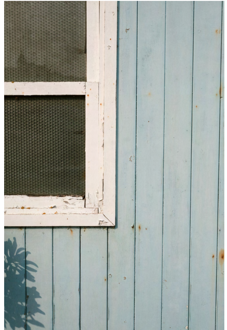
The GOA PRINT is an exquisite artwork, hand-painted in watercolor by the designer. It displays a jubilant array of blue shades, capturing the beauty of banana leaves and bringing out the serene and tropical essence of Goa, India.