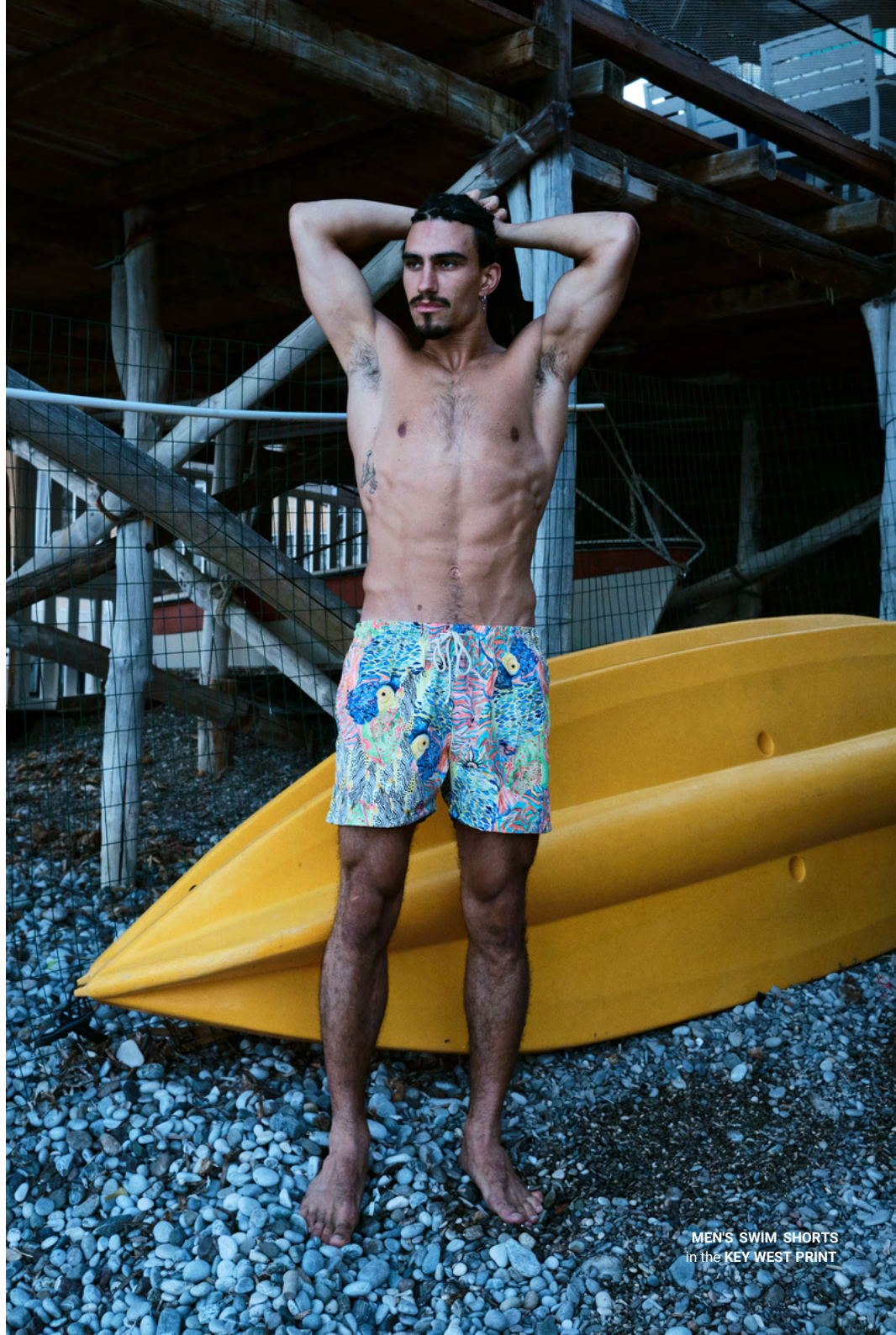
MEN'S SWIM SHORTS in the KEY WEST PRINT